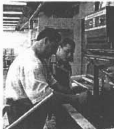
DELANCEY STREET FOUNDATION

Although the average resident is functionally illiterate and unskilled when entering, all receive a high-school equivalency certificate and are trained in marketable skills before graduating. During the minimum stay of two years (the average stay is four), residents learn not only academic and vocational skills, but also the interpersonal, social survival skills, and the attitudes,