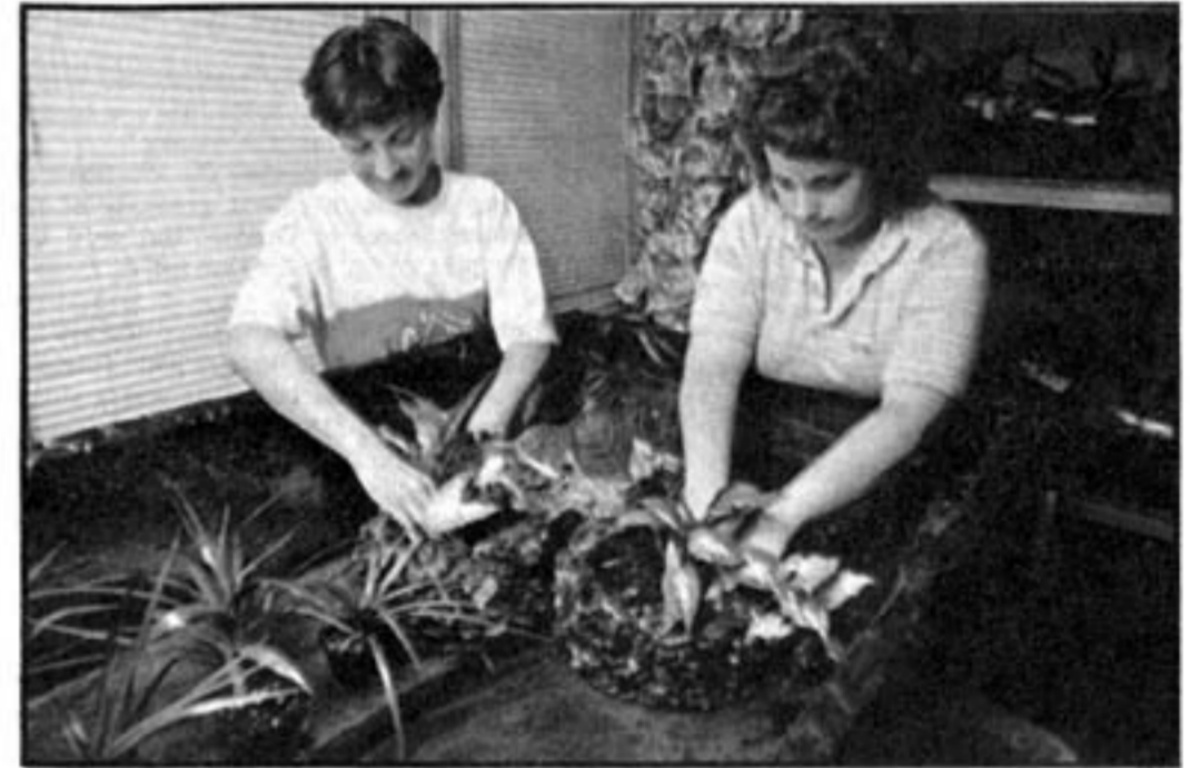
Clients Sell Plants, Services To Support Program

Delancey Street clients grow plants, sell cups and glasses, move furniture, work construction and make money any other way they can that's honest. Corporate sponsors donated food, clothing and furniture to open the Greensboro house last October. But the program's goal is self-support within three years. That means the sales and other businesses at Delancey Street eventually