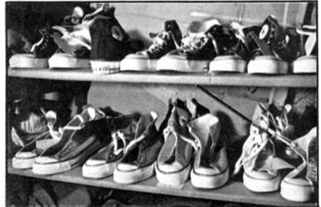
Donors Provided Clothing, But Ultimate Aim Is Self Sufficiency