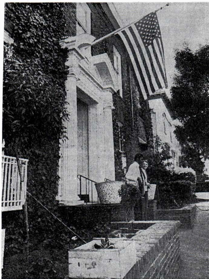
Two residents in front of the Delancey Street house, 3001 Pacific avenue